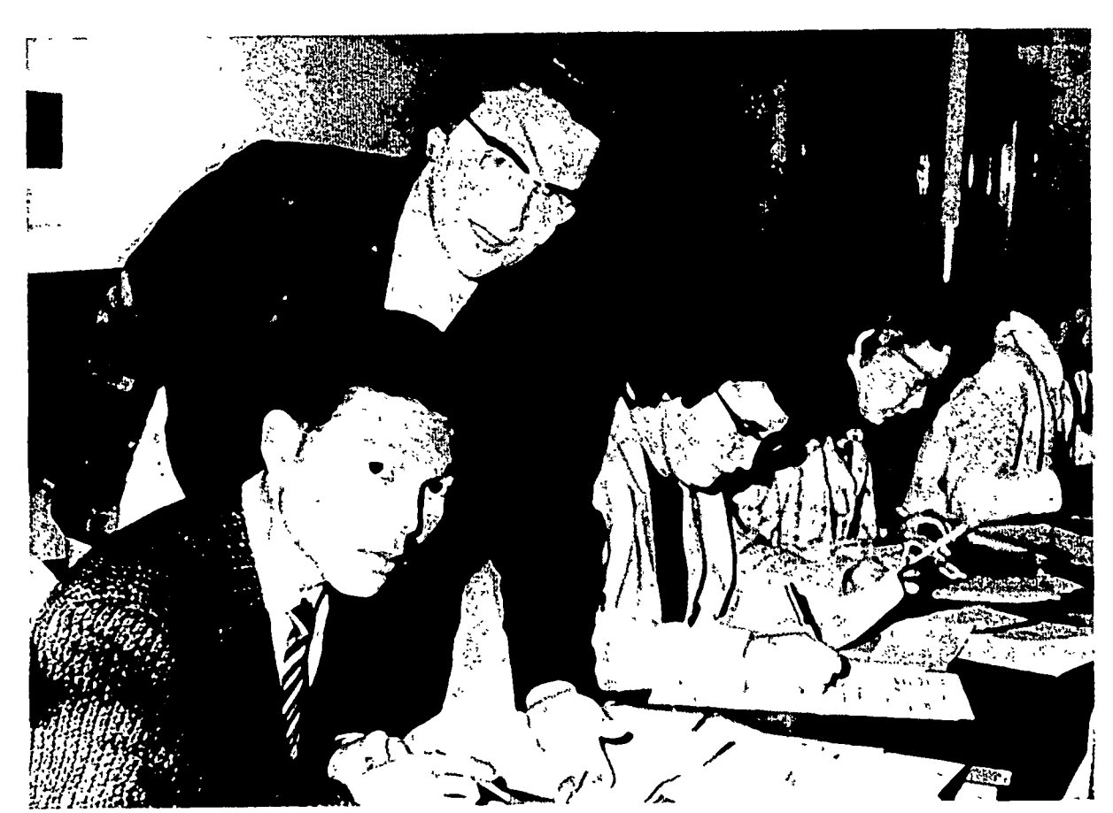
Brandon College Registration 1961